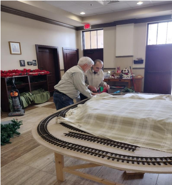
Knights in Support of Decorating the church