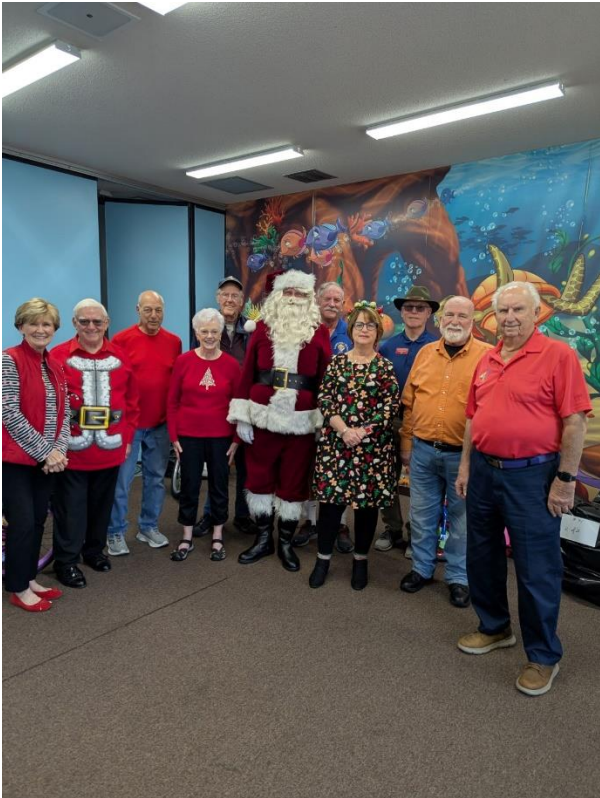
Knights in Support of Children's Christmas Party